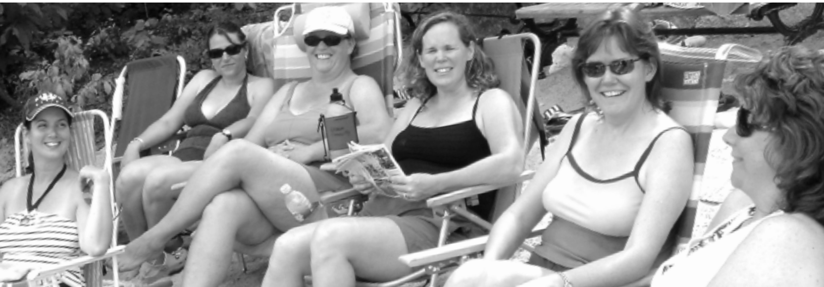
Friends relaxing at Membership Beach.

Membership Beach is a private beach environment open to members only, seven days a week, from the Saturday before Memorial Day to Labor Day, for one low all inclusive fee. Numbers of family memberships are limited to 420.