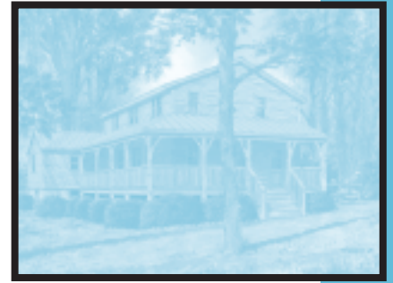
View of the new Trading Post

Three partner organizations that conduct camp at Hale will immediately benefit from improvements to the Trading Post Village. Cooper Community Center from Roxbury, Bird Street Community Center from Dorchester and Massachusetts General Hospital's YouthCare Program operate programs in the buildings and sites that will be improved. The first two camps serve children from the city of Boston, while YouthCare serves children with Asbergers syndrome, a form of autism.